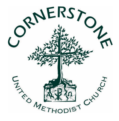
Second Sunday of Easter April 7, 2024